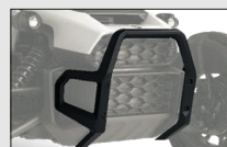
3 Adventure Front Bumper (219401193)