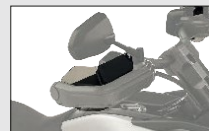
2 Handguard Deflectors (219401186)