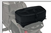
5 LinQ sport bag (860202447)

Select between more than 40 possible accessories to suit all your needs for your next adventure! The integration of the LinQ system with LinQ Nano, LinQ Lite and LinQ 16" anchor points for an easy, versatile and robust accessorization of the Can-Am Canyon.