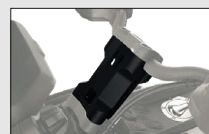
4 Fixed Riser - 6 in. (155 mm) (219401211)