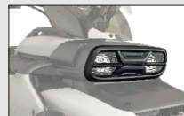
1 Headlight Protector (219401171)