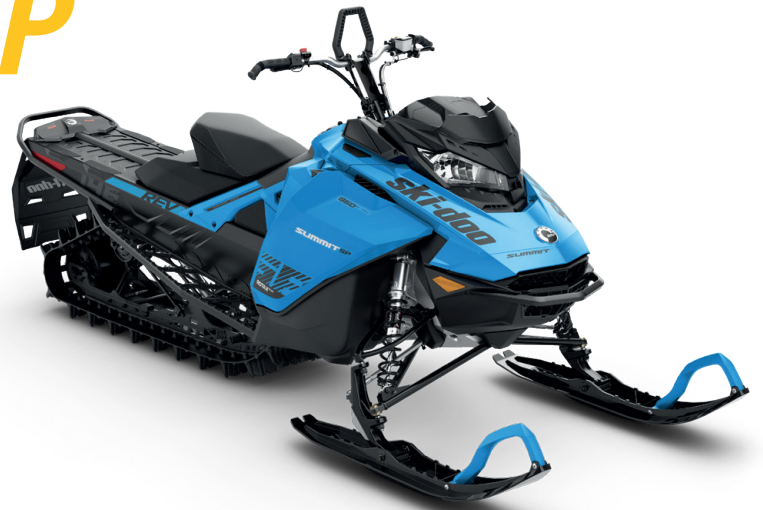
SUMMIT® SP 146 850 E-TEC® shown