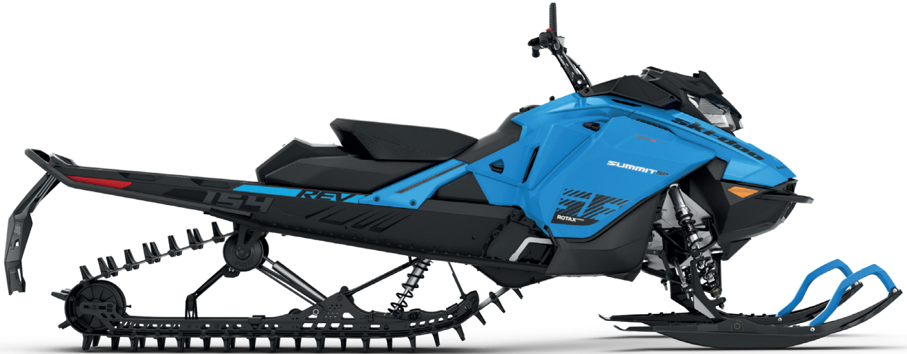
SUMMIT® SP 154 600R E-TEC® shown