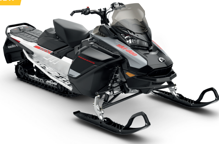
RENEGADE® SPORT 600 ACE™ shown