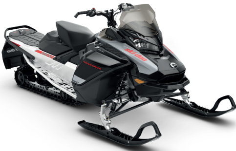
RENEGADE® SPORT 600 ACE™ shown