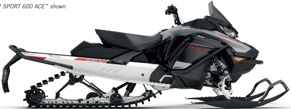
RENEGADE® SPORT 600 ACE™ shown