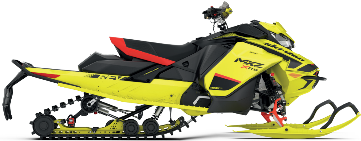
MXZ® X-RS® 850 E-TEC® shown