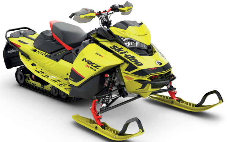
MXZ® X-RS® 600R E-TEC®