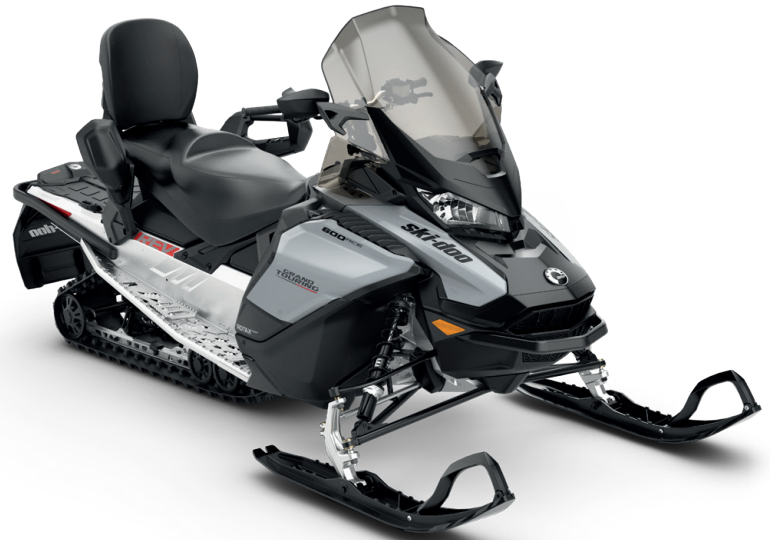
GRAND TOURING SPORT 600 ACE™ shown