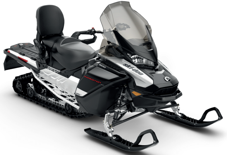
EXPEDITION® SPORT 900 ACE™ shown