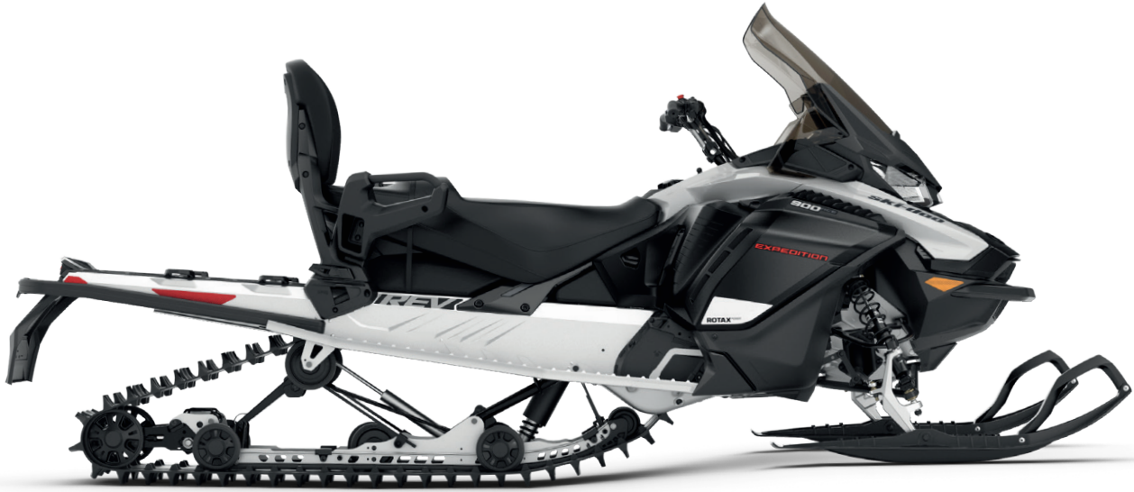
EXPEDITION® SPORT 900 ACE™ shown