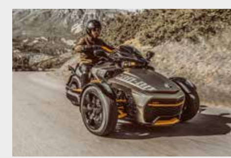
SPECIAL SERIES: A special package for the sport enthusiasts that come pre-equipped with several accessories and custom graphics.