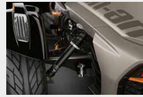
FOX SHOCKS: Sport-tuned, gas-charged front shocks give you a responsive, sporty feel and great performance on the most demanding roads.