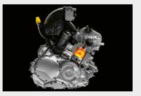
ROTAX 1330 ACE ENGINE: 115 hp engine. More power can only mean one thing – better performance. Our most powerful engine allows you to challenge the road knowing you have the horsepower you want when you need it.