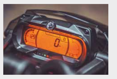
DIGITAL GAUGE: 7.6" wide digital display with a simplistic design to see everything you need.