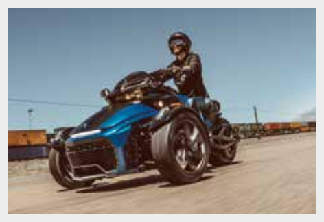
VSS: Vehicle Stability System that uses a variety of technologies, including SCS / ABS / TCS, to monitor the vehicle and keep the rider confident on the road.